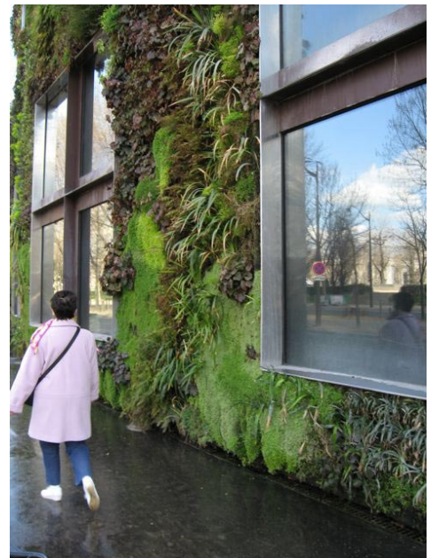
Living Wall, Designer Patrick Blanc, Paris