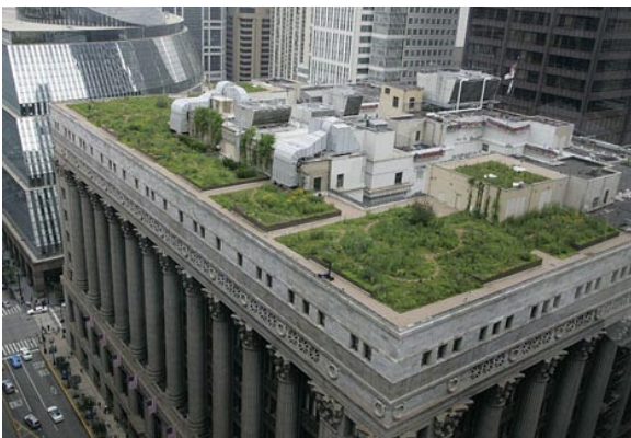
Green Roof, McDonough + Partners, Chicago

“a pleasure to work with . . .” “no egos, real team players . . .”