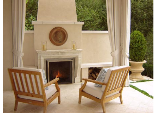
The Privacy Fantasy as seen in HouseBeautiful

“The clearest, biddable construction documents and irrigation plans I’ve ever seen from any landscape architect I’ve worked with, and I’ve seen a lot. everGREEN takes the guesswork out of bidding, and in the end, everybody is happy.”