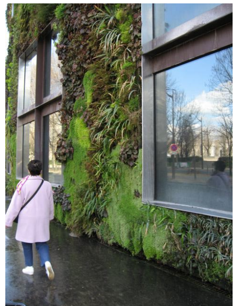
Living Wall, Designer Patrick Blanc, Paris